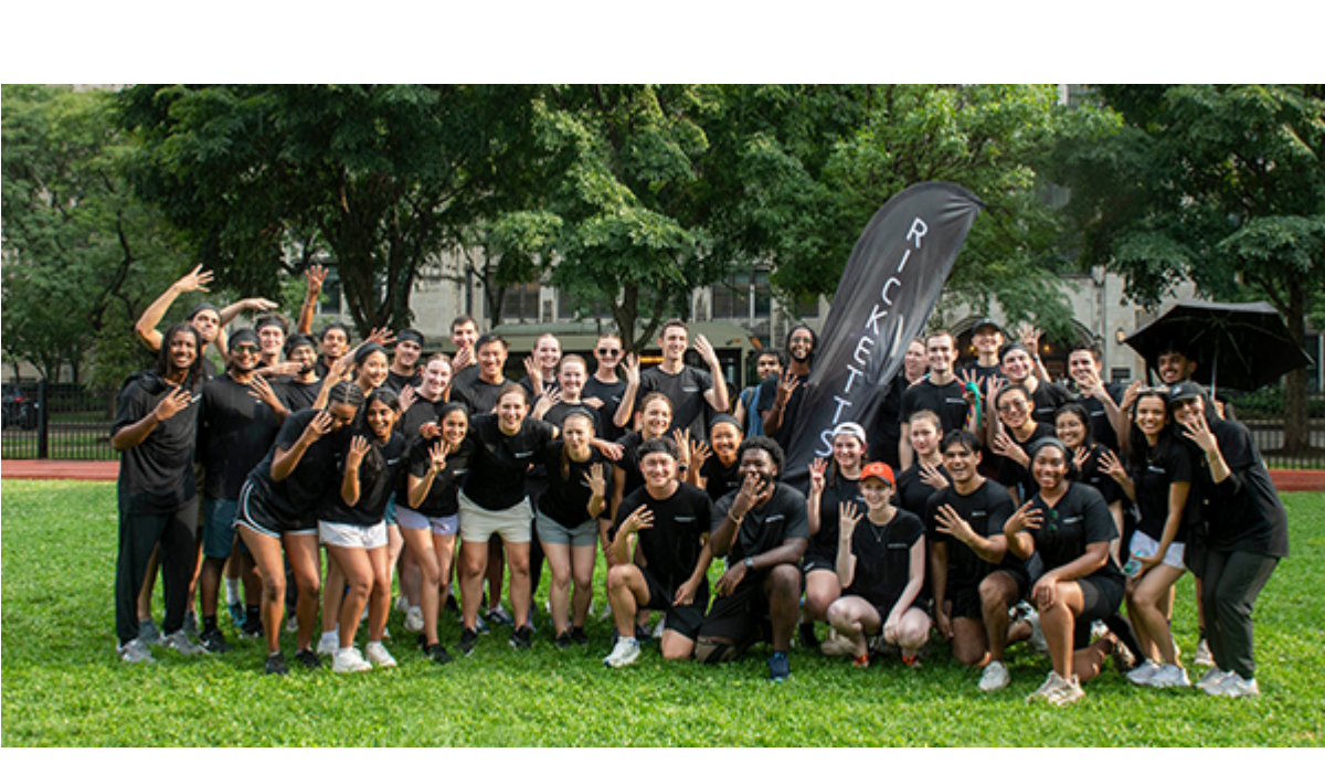
The Ricketts Society—Society Olympics champions for the fourth year in a row.

The Medical Alumni Association was thrilled to take part in this year’s Society Olympics on August 16. Students from the four medical student societies—Ricketts, Lawless, Thompson, and Cooper, all named after distinguished alumni—battled it out in a series of physical and mental challenges to claim the top spot.