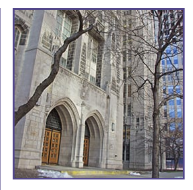
VISIT THE MAA'S PLAN IT PURPLE PAGE