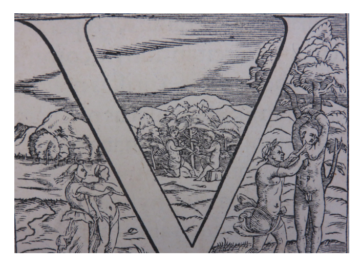
The letter "V" in the Galter Library's 1555 copy of Vesalius.

The library is also dedicated to preserving the rich heritage of Northwestern University Feinberg School of Medicine. Our Special Collections contain valuable